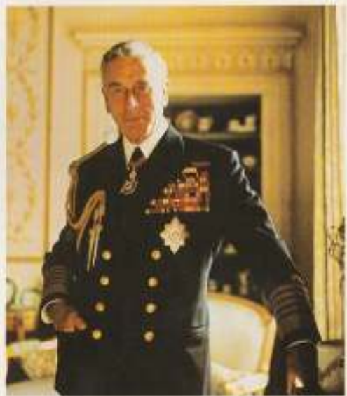
In 1925 Lieutenant Lord Louis Mountbatten attended Specialist Communications Courses at the Signal School in Portsmouth and at Greenwich. He came top of his course and qualified as a member of the Institute of Electrical Engineers. In 1927 he became the Assistant Fleet Wireless Officer to the Mediterranean Fleet. After that he was the Senior Instructor at the Signal School where he wrote the first comprehensive textbook on wireless sets used in the Royal Navy. In 1931 he returned to the Mediterranean as Fleet Wireless Officer and was responsible for many inventions and improvements to Naval Communications. His career in the intervening years is well known and included the Command of HMS KELLY. In 1972 Admiral Mountbatten gave the name of his famous ship to the New Entry Training Squadron at HMS MERCURY and he regularly took the Salute at the Annual Open Day Parade. The Senior Naval Signals Officer made his last visit to HMS MERCURY on Friday 27 July 1979 at the annual Signal Officers Reunion. We remember him not only as a great man and an eminent Naval Officer, but also as the best known Communications officer in the Royal Navy.