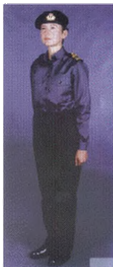
Fig 39A-11a. Officers