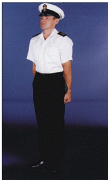
Fig 39A-8c. Junior Ratings