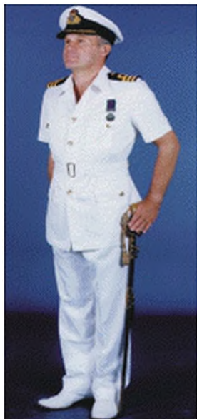
Fig 39A-13a. Officers (Male)