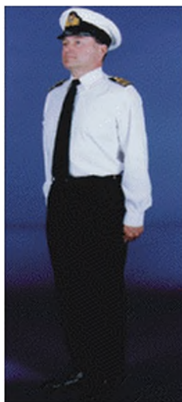
Fig 39A-7c. Warrant Officers and Senior Ratings