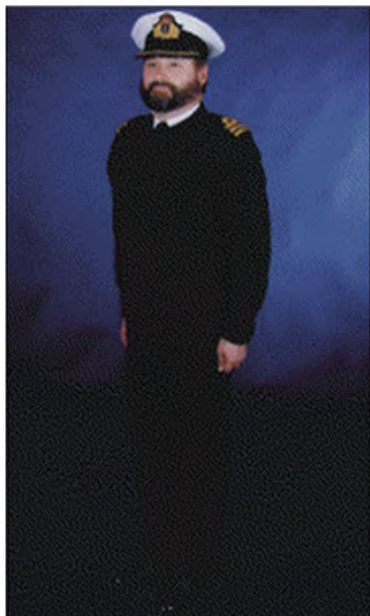
Fig 39A-9a. Officers