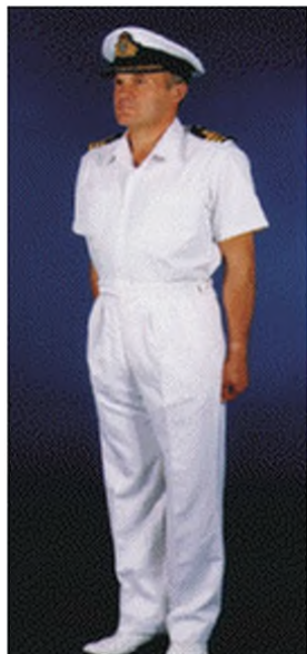
Fig 39A-19a. Officers (Male)