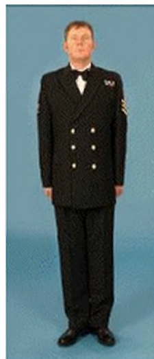
Fig 39A-5b. Warrant Officers and Senior Ratings (1C Evening)