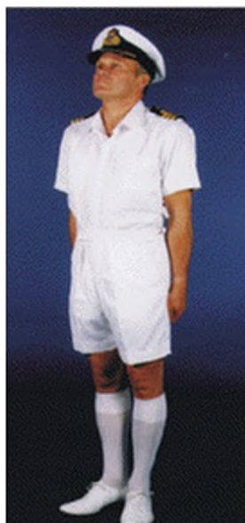
Fig 39A-20a. Officers