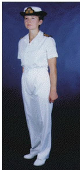
Fig 39A-19b. Officers (Female)