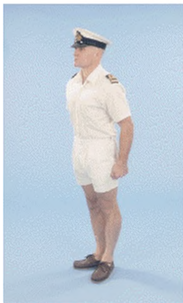
Fig 39A-21a. Officers