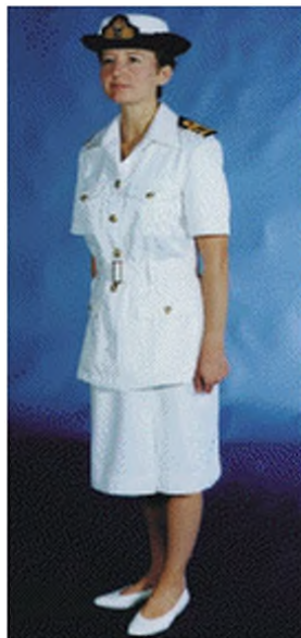
Fig 39A-15b. Officers (Female)