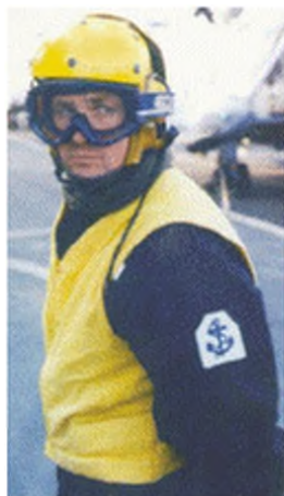
Fig 39A-12a. Flight Deck Rating