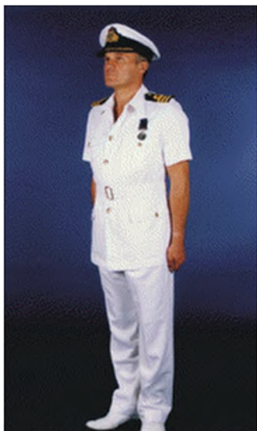
Fig 39A-14a. Officers