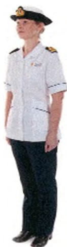
Fig 39A-12e. Clinical Uniform Officer (Female)