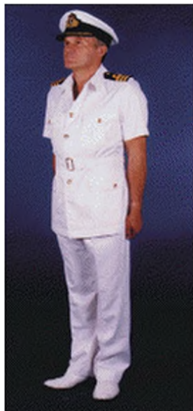
Fig 39A-15a. Officers (Male)