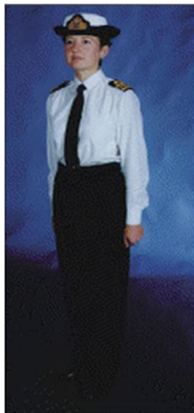
Fig 39A-7a. Officers (Female)