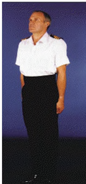
Fig 39A-18a. Officers (Male)