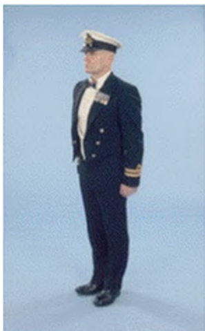
Fig 39A-4a. Officers