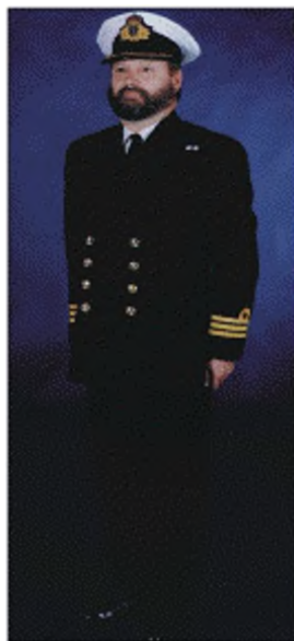
Fig 39A-3a. Officers (Male)