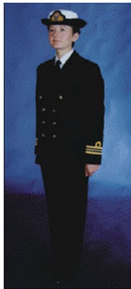
Fig 39A-3b. Officers (Female)