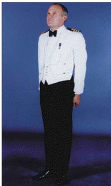
Fig 39A-16a. Officers