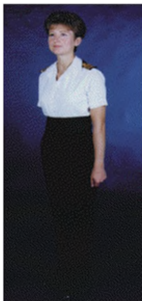
Fig 39A-18b. Officers (Female)