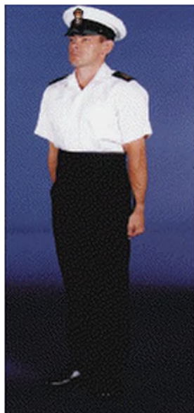
Fig 39A-18c. Warrant Officers and Senior Ratings