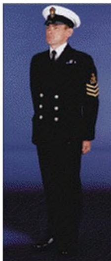
Fig 39A-4b. Warrant Officers and Senior Ratings