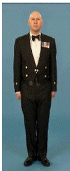
Fig 39A-5c. Warrant Officers and Senior Ratings (Optional Mess Kit)