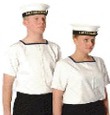
Fig 39A-24. Uniform Fitting Guide (Junior Rates)

Shirts start with collar buttoned 1/4 in. each side and buttoned to center front.