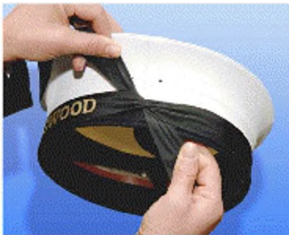
Fig 39A-25. Tying a Cap Ribbon

1. Place the ribbon on the crown of the cap, and pull it taut across the front of the cap. The ribbon should be pulled taut across the front of the cap, and the ends should be pulled taut across the back of the cap.