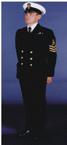
Fig 39A-3c. Warrant Officers and Senior Ratings