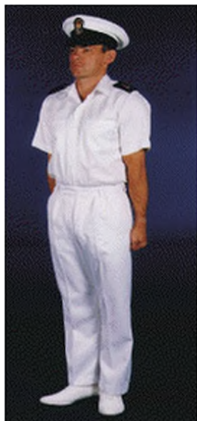
Fig 39A-19c. Warrant Officers and Senior Ratings