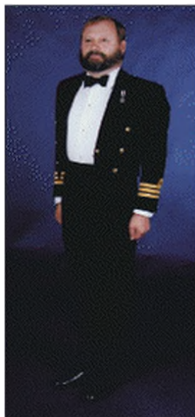
Fig 39A-5a. Officers