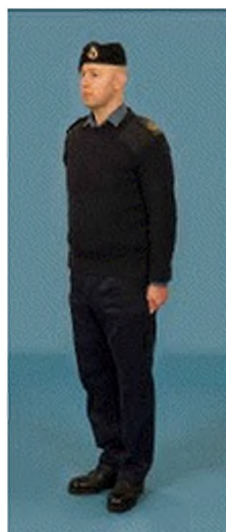
Fig 39A-11b. Warrant Officers and Senior Ratings