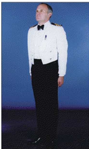
Fig 39A-17a. Officers