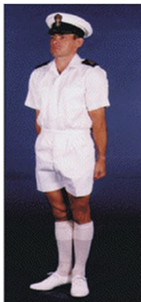
Fig 39A-20b. Warrant Officers and Senior Ratings