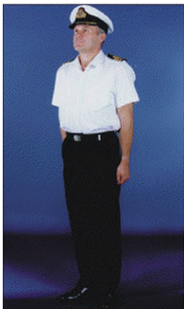
Fig 39A-8a. Officers