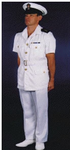
Fig 39A-15c. Warrant Officers and Senior Ratings